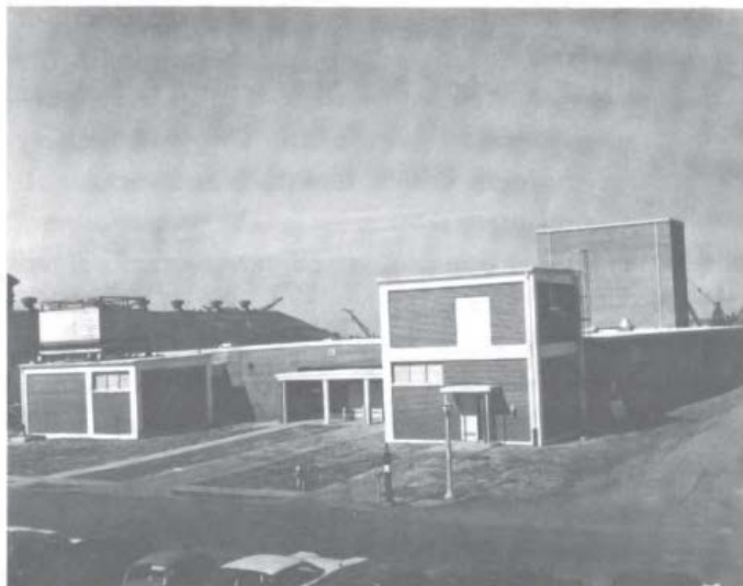
Figure 1. New facility provides special environmental conditions, including temperature, humidity, dust and vibration control required for precision electronics and optical equipment repairs.

Early in 1960, Charleston Naval Shipyard was designated as the primary logistics support point